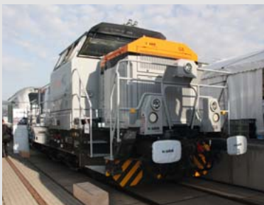
Rail vehicle manufacture